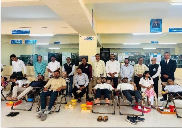
“Chief Guest, Directors, Principal gather during the blood donation camp, showing support for the cause and those who donated”