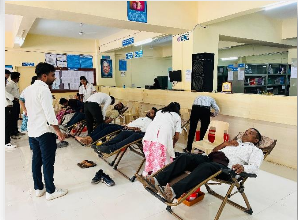
"Volunteer students with our staff during the blood donation camp."