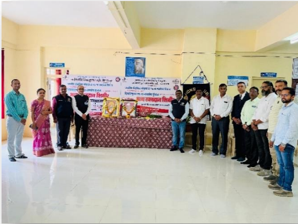
“Saraswati Poojan at the hands of the Guests”