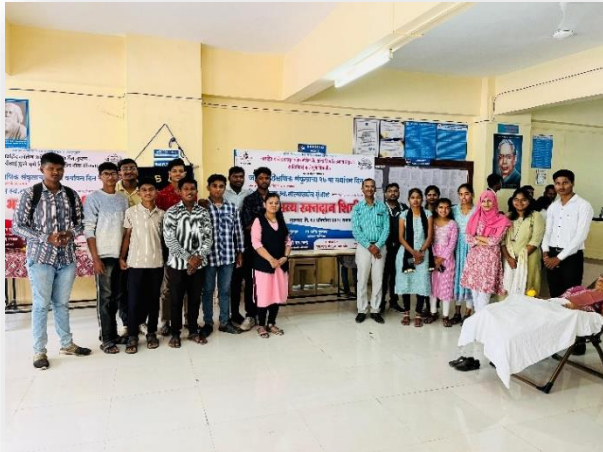
"Certificate distribution to volunteers after the blood donation camp, appreciating their efforts."