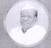
Hon'ble Late Shri Tatyasaheb Gunjal Founder-President