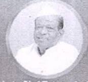
Hon'ble Late Shri Tatyasaheb Gunjal Founder-President