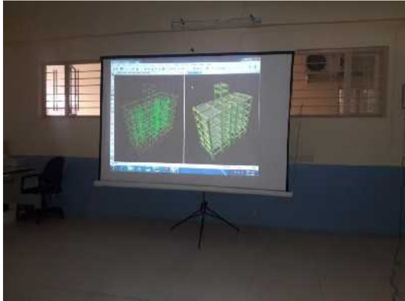
Image showing 3 D model of Structure after analysis