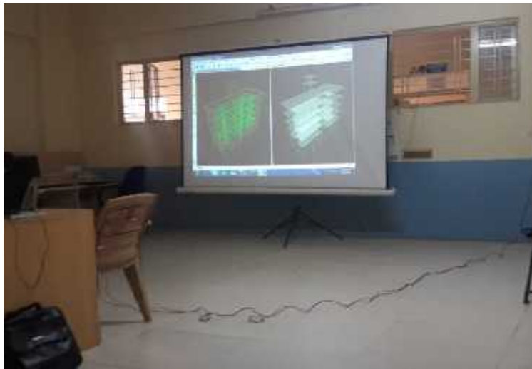
3D Structure model