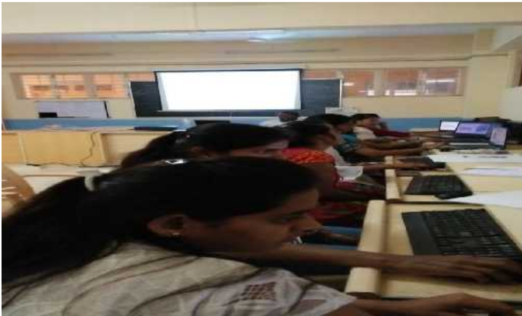
Students While Attending ETABS Software Training