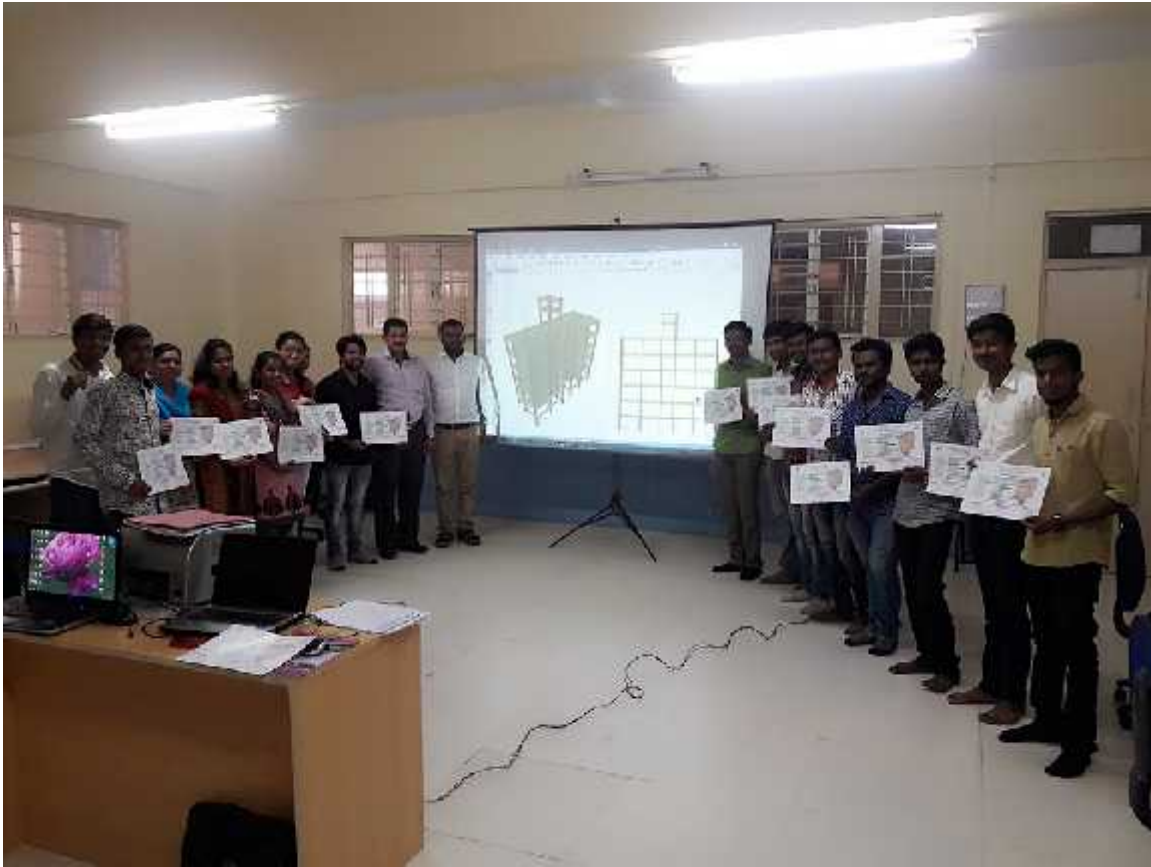
Certificate Distribution of ETABS Software Training