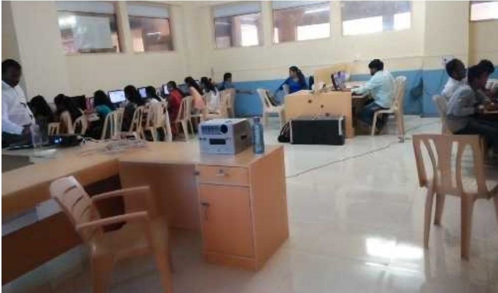
Students While Attending ETABS Software Training