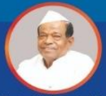
Hon'ble Late Shri Tatyasaheb Gunjal Founder-President