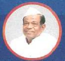
Hon'ble Late Shri Tatyasaheb Gunjal Founder-President