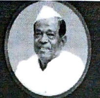
Hon'ble Late Shri. Tatyasaheb Gunje Founder-President