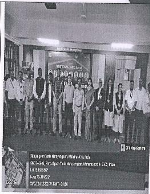
Participants attending summit