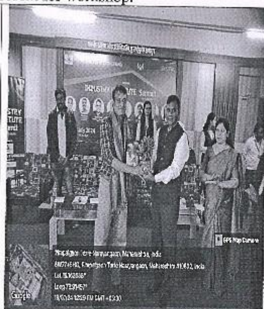
Felicitation of Guest Person