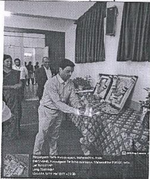
Saraswati Pujan by guests