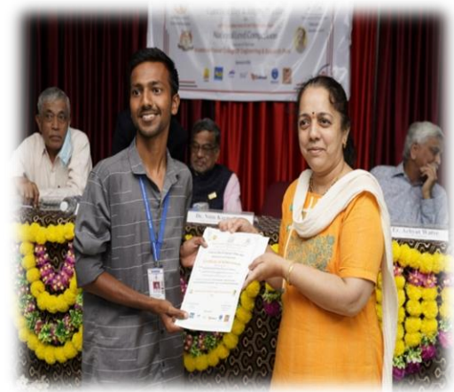
1 st Prize in Techconcrete event (Pune)