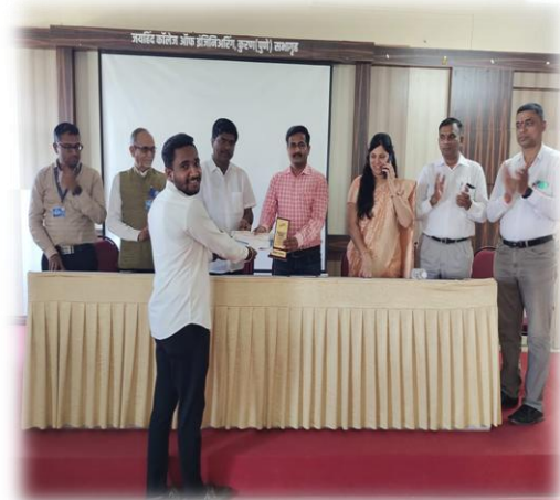
1 st Prize in Techconcrete event (JCOE)