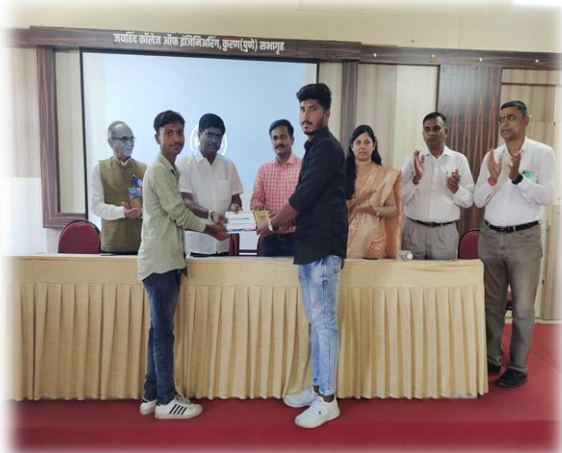
2 nd Prize in Model Making event (JCOE)