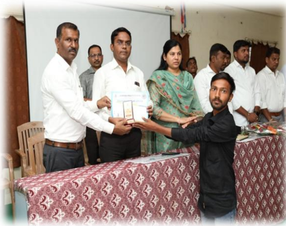
2 nd Prize in Technophillia event (JP)