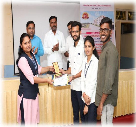
2 nd Prize in Departmental level conference (JCOE)