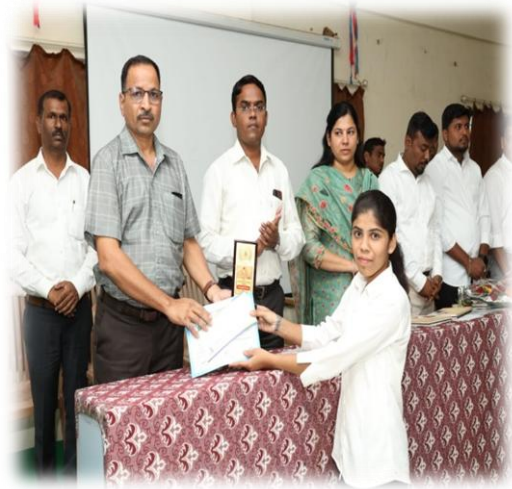
1 st Prize in Technophillia event (JCOE)