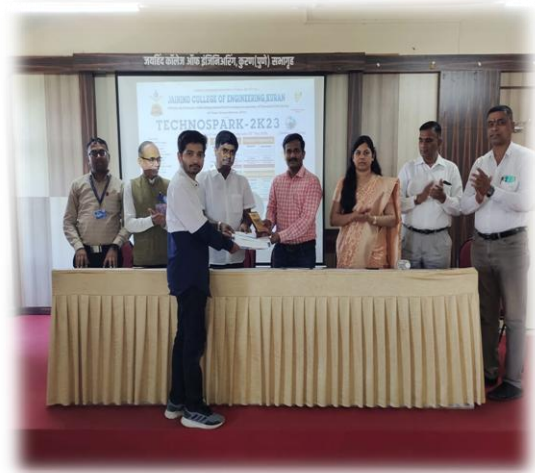
1 st Prize in Model Making event (JCOE)