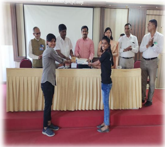
2 nd Prize in Techconcrete event (JCOE)